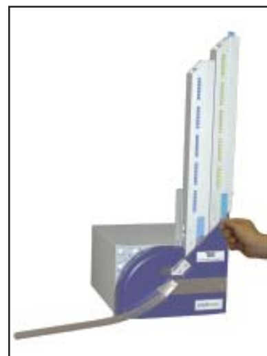
Place loaded hopper on SHUR/Mark® and pull tape down to seat cassettes.