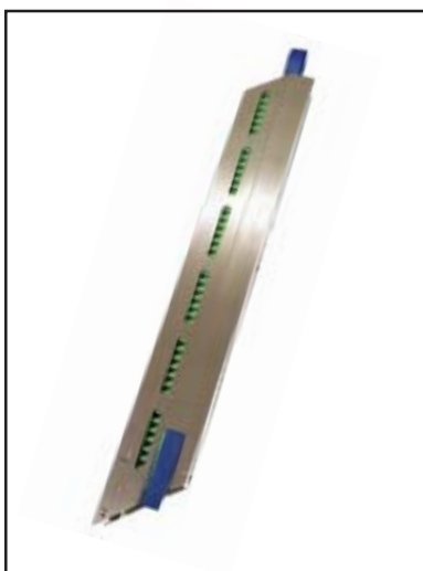
Specialty dispensing hopper (SM-TSDH) accepts prepkg'd cassette sleeves.