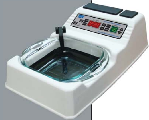
FWS-S (8" x 8" x 2 1/4")

Imagine... the practicality of a removable glass dish, the long-term aesthetics afforded by a scratch and chemical resistant plastic housing, the optimum specimen viewing provided by a high contrast background illuminated by an LED light array and the dependability & safety of up-to-date microprocessor controlled electronics ... combined with the convenience of a HISTO/Orientator™ for flattening sections and a heated slide dryer all in one compact unit.