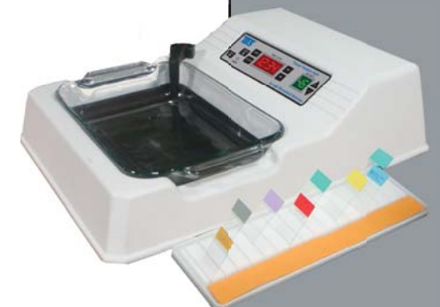
TFB-L (8" x 11" x 2") shown w/SDR-S