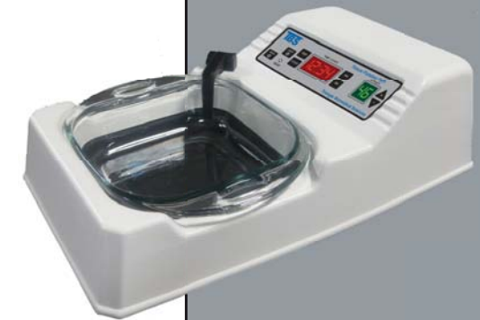
TFB-S (8" x 8" x 2 1/4")

Slide rack accessory for drain-drying slides can be ordered for positioning on the front or on either side of the bath.