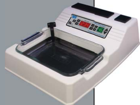
FWS-L (8" x 11" x 2")