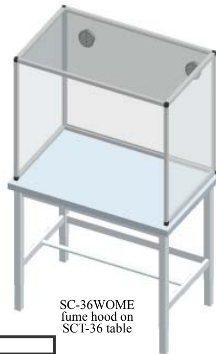
SC-36WOME fume hood on SCT-36 table

Rigid support tables are available for each hood size with leveling legs. Table height adjusts from 28 (72) to 34 (87) in (cm) in two inch increments for user comfort. Order tables separately, if needed.