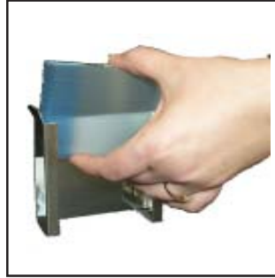
Conveniently load slides into SHUR/Mark® hoppers