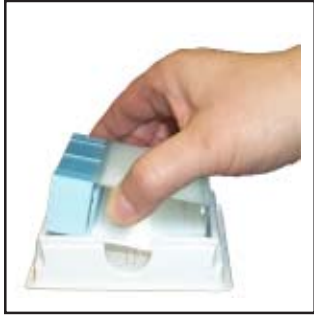
Thumb-tab box facilitates slide pick-up & handling