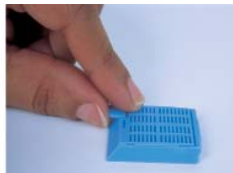
Press down on cover & snap securely in place