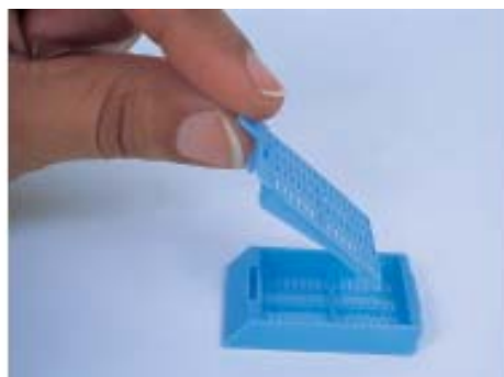
Cover can remain open once locked into place