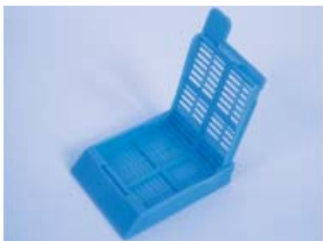
Insert cover until hinges click firmly into tracks