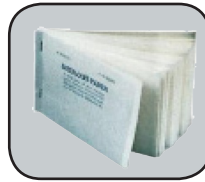
SHUR/View™ Lens Paper

Removes dirt, dust and fogging from lenses while creating a protective layer on lenses to prevent further residue build-up.