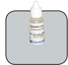
SHUR/View™ Immersion Oil

Dust-free lens tissues are ideal with liquid cleaners. Used to clean microscope lens and objectives.